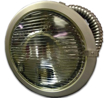
Sequenced Flasher for MALSR and REIL Runway Lighting System P/N 44D0551 NSN 6210-01-205-0493